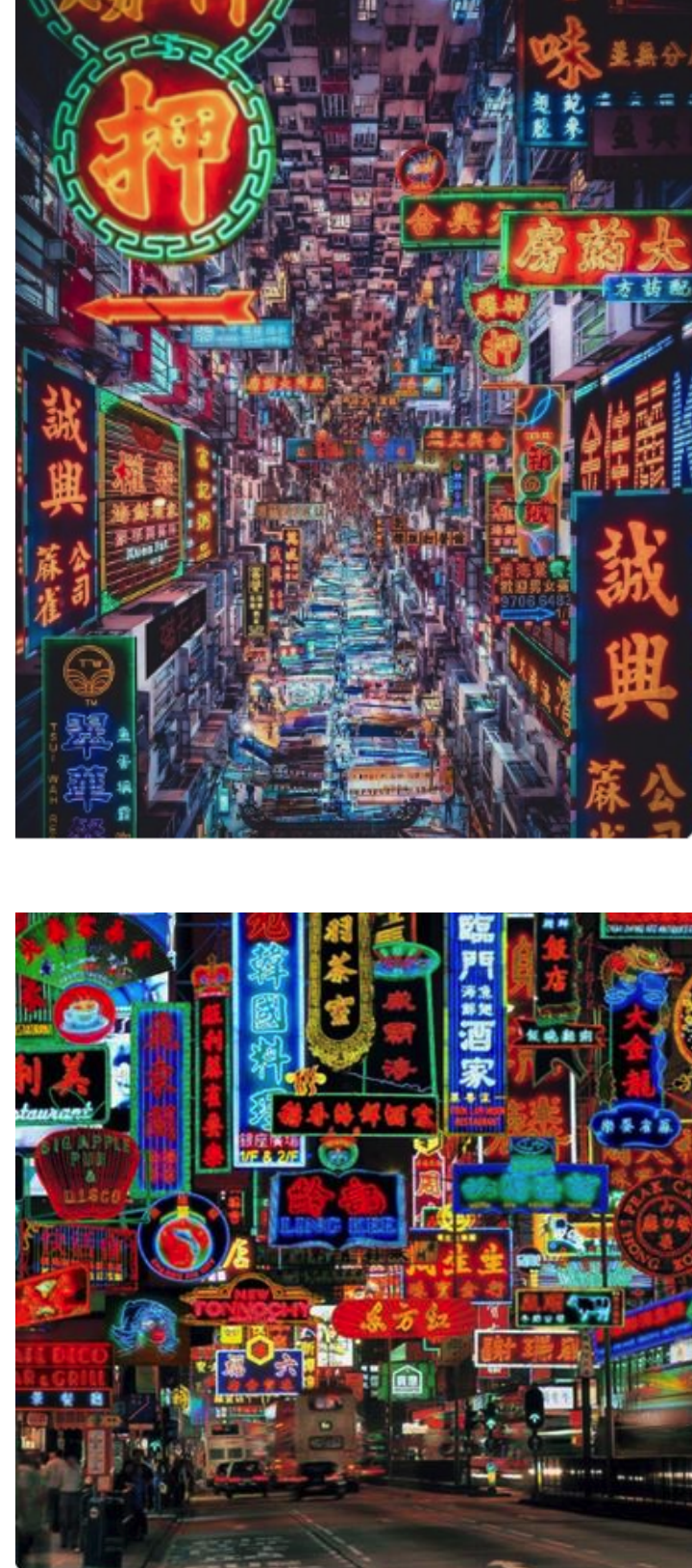
SG3 Hawker Lane Illuminated Signage and Lighting Suspended over Laneway.