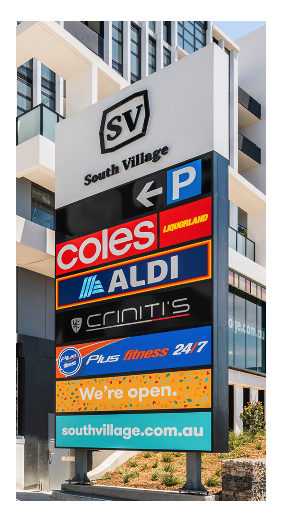
SG4 Pylon Retail Signage

NOTES THIS DRAWING IS COPYRIGHT © OF TURNER. NO REPRODUCTION WITHOUT PERMISSION. UNLESS NOTED OTHERWISE THIS DRAWING IS NOT FOR CONSTRUCTION. ALL DIMENSIONS AND LEVELS ARE TO BE CHECKED ON SITE PRIOR TO THE COMMENCEMENT OF WORK. INFORM TURNER OF ANY DISCREPANCIES FOR CLARIFICATION BEFORE PROCEEDING WITH WORK. DRAWINGS ARE NOT TO BE SCALED. USE ONLY FIGURED DIMENSIONS. REFER TO CONSULTANT DOCUMENTATION FOR FURTHER INFORMATION DWG, IFC AND BIMX FILES ARE UNCONTROLLED DOCUMENTS AND ARE ISSUED FOR INFORMATION ONLY. Aoyuan International Suite 30.02, Lvl 30, 420 George Street Sydney NSW 2000